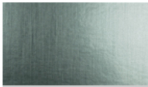
M012 Silver Aluminium