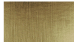
M022 Gold Chrome