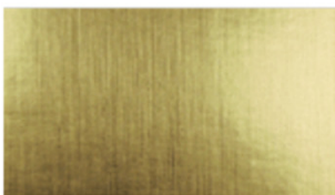
M19 Gold Aluminium