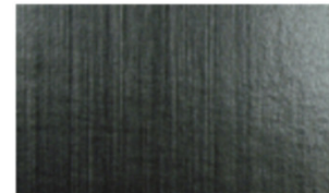
M018 Silver Chrome Dark