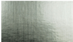
M015 Champagne Aluminium